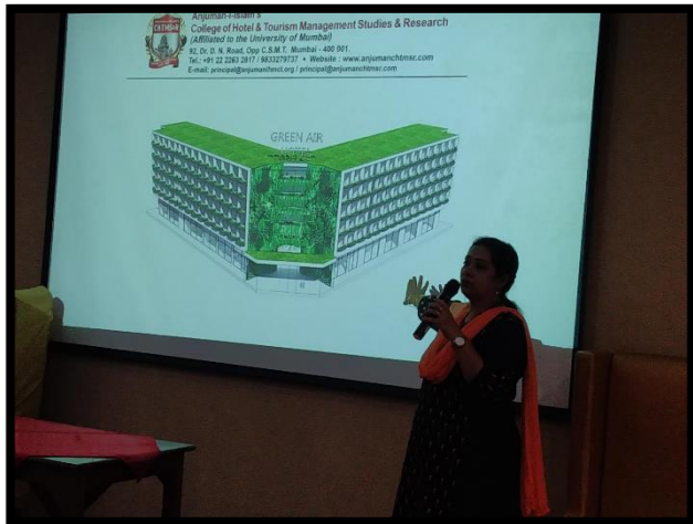
Guest session on Hotel Designs in today's world 13/01/22