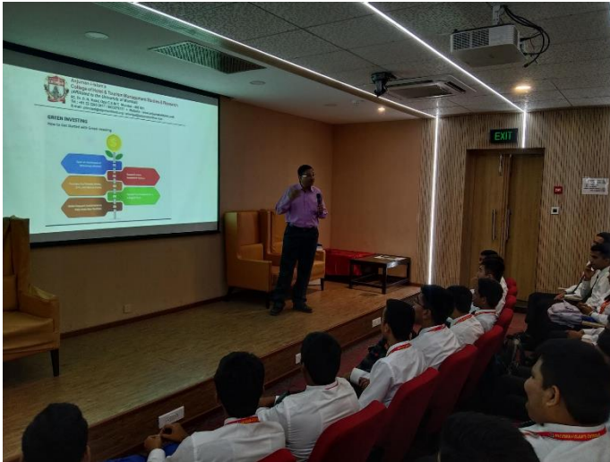
Session on green Investing 17/05/2022