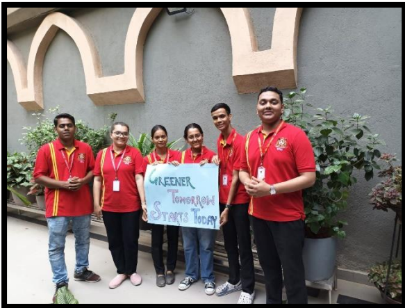
Rally for Nature 25/01/22