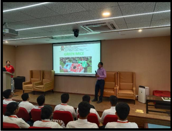
Understanding Green MICE 26/07/2021