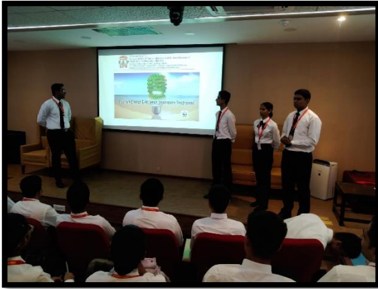
Understanding energy efficiency in Tourism 19/01/22