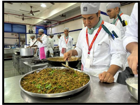
Session on healthy food cooking 24/01/22