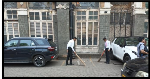
Cleanliness Drive 07/09/2021