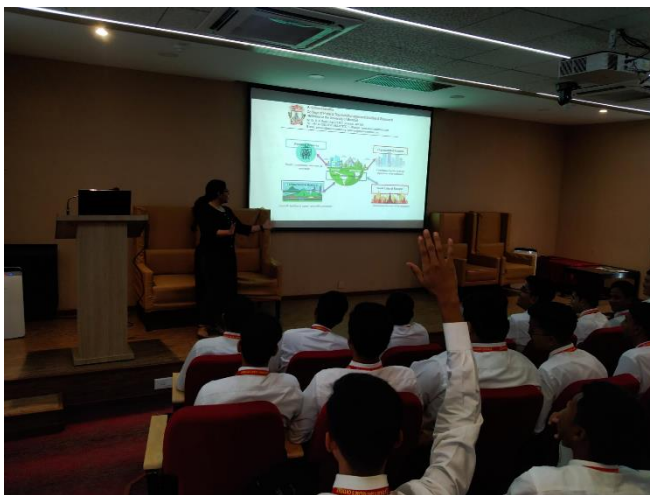
Session on Carbon Neutral Tourism 08/06/22