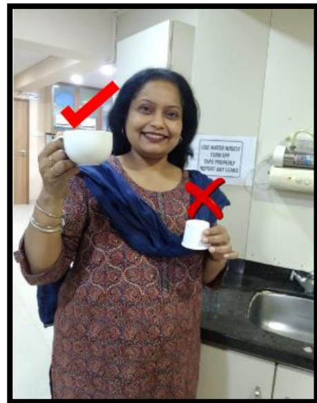
Importance of using washable crockery 15/02/22