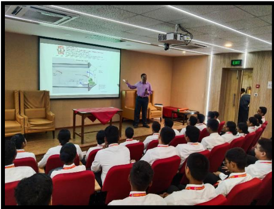
Session on Green Air Rooms in Hotels 26/09/2021