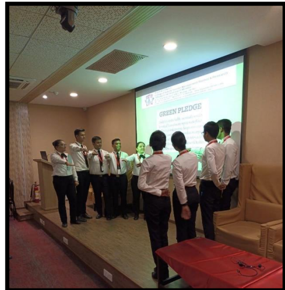
Students taking Green Pledge