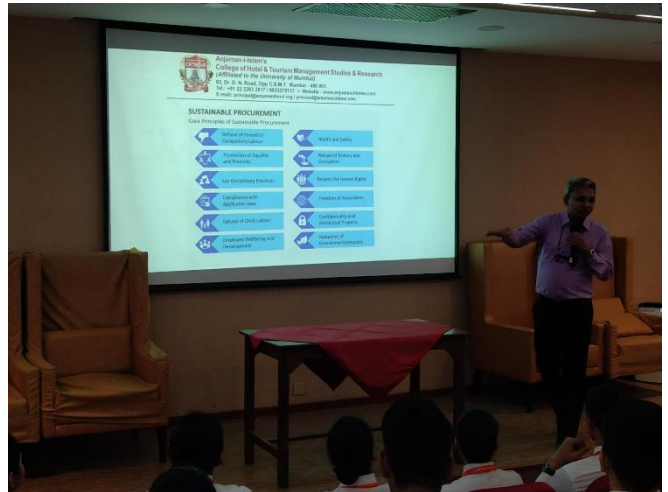
Green Procurement 11/01/22