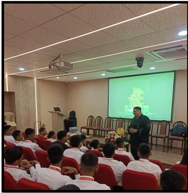
Sustainable Gastronomy 26/08/21