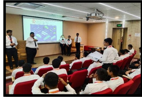
Understanding Responsible Transportation – Presentation by students 26/07/21